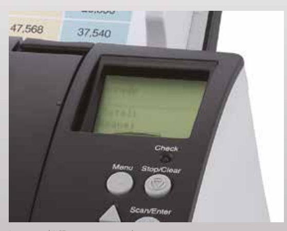
Integrated LCD operating panel

These are the first desktop scanners in the World equipped with iSOP (Intelligent Sonic Paper Protection); which detects changes in the acoustic noise generated by paper and enhances the paper feeding process. Additionally they feature innovatively developed hardware and software to help augment your daily routines and boost your organisation's efficiency.