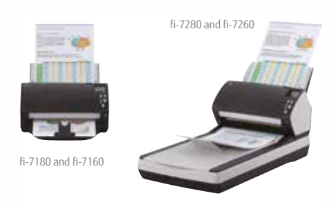
fi-7160 / fi-7260 - A4 Portrait at 300 dpi 60 ppm / 120 ipm fi-7180 / fi-7280 - A4 Portrait at 300 dpi 80 ppm / 160 ipm Scan mixed batches up to 80 sheets