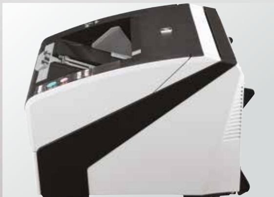
fi-6400 side view

These automated routines can help deliver a performance bonus to document-hungry businesses when archiving records, satisfying compliance requirements and introducing bulk document sets to workflows. The result is a robust scanner with an impressively low total cost of ownership compared to other models within and beyond its class and as such provides a fast return on investment.