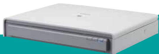
Optional A3 Flatbed Scanner Unit 201