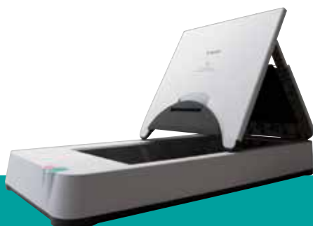
Optional A4 Flatbed Scanner Unit 101

The DR-M1060 comes with a host of optional accessories that enable users to be even more productive. The A4 and A3 optional Flatbed Scanner units allow users to scan bound books, journals and fragile media. These USB-connected dual-scanning flatbed units work seamlessly with the DR-M1060, so users can apply the same image-enhancement features to any scan. A 2D Barcode Module is also available that enables barcode recognition of QR codes, PDF417 and Data Matrix formats.