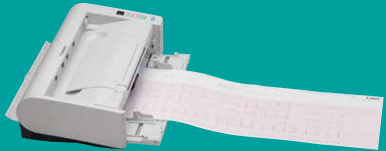
Long Paper Scanning