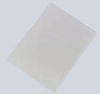
Carrier sheet KV-SS076

*100 - 600 dpi (1 dpi step) (B/W and Color)